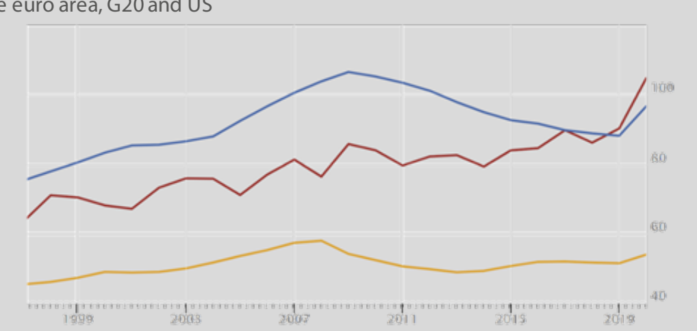
Figure 1: Bank lending to private non-financial sector as percentage of GDP for the euro area, G20 and US

Firms' financing operations in euro area and the United States have historically been carried out through different mixes of bank-based and market-based approaches. In Europe, banks have played a predominant role for channelling funds to firms and borrowing to households, while the US has witnessed the prevalence of capital markets as instruments for channelling credit. Figure 1 depicts private non-financial sector borrowing from banks as a fraction of GDP. The blue line depicts the series for the euro area, while the yellow line is the series from the US. The rest of the developed world is also more bank-dependent, as shown by the series for G20 countries in red.